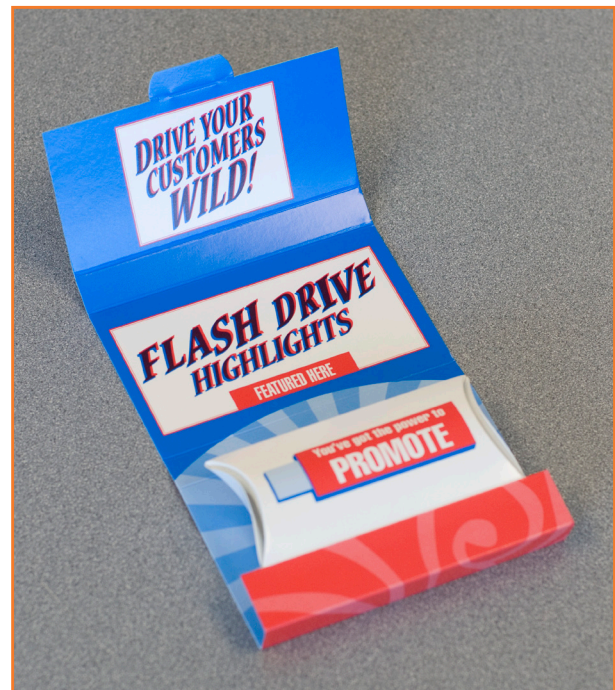
Pouch attached to inside pocket holds your USB flash drive!